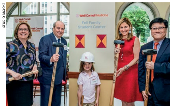
At the 2017 wall-breaking for the Feil Family Student Center.