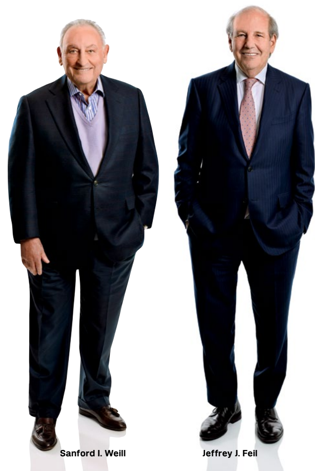
Sanford I. Weill