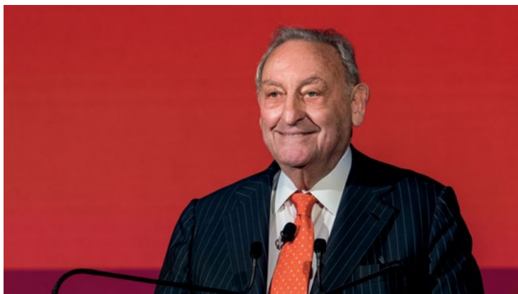
Sanford I. Weill, co-chair, We're Changing Medicine campaign