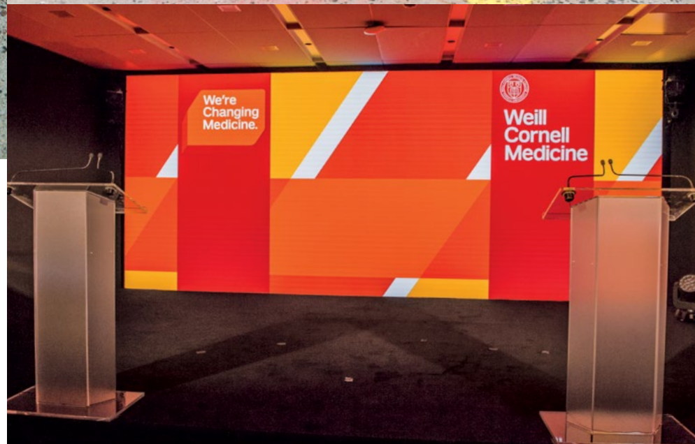
Part of The Starr Foundation-Maurice R. Greenberg Conference Center in the Belfer Research Building was transformed into a live broadcast studio for the campaign launch.